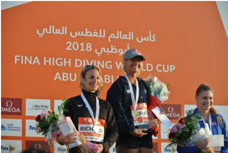
The women's podium